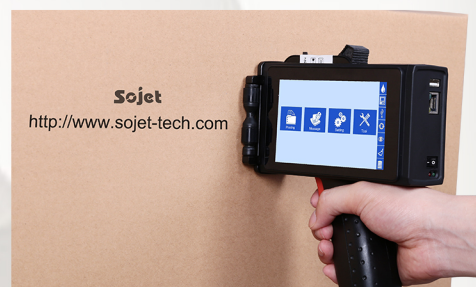
Different views of Dragon I printer